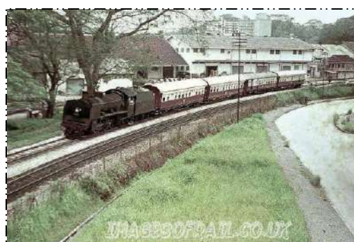
Facebook · Klang Bandar DiRaja The Sodthi Express. Picture by Peter Hodge at circa 1969