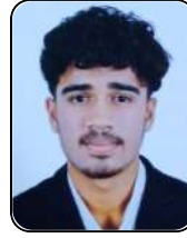
Daneshwara a/ Sundrasagar